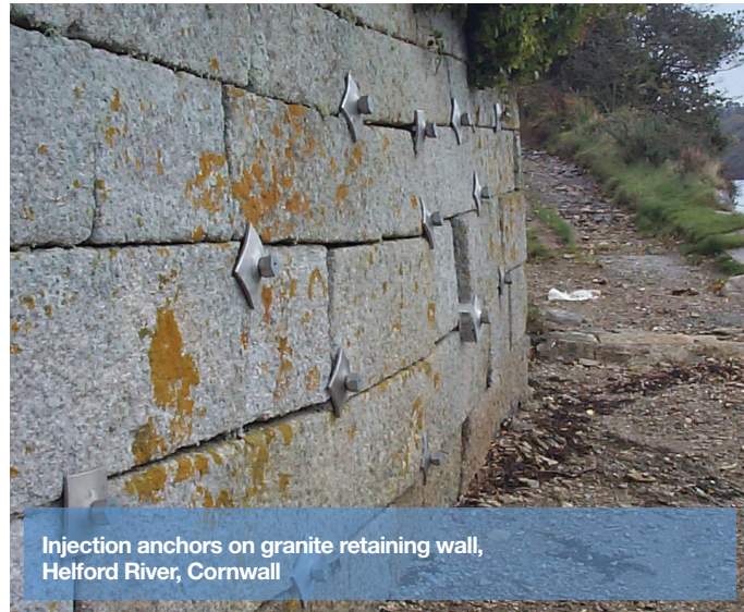
Injection anchors on granite retaining wall, Helford River, Cornwall

The bond of the injection anchor is in accordance with BS 8110 and BS 6744, the continuous thread provides a key for the grout.